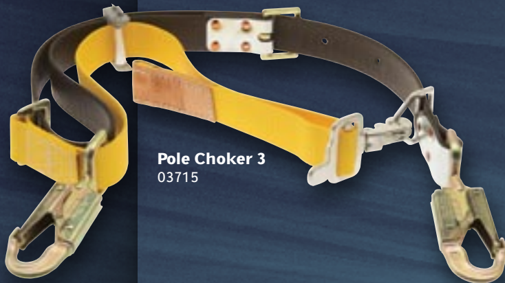
Pole Choker 3 03715