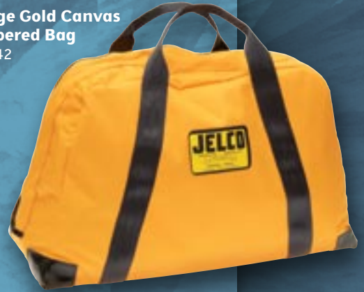
Large Gold Canvas Zippered Bag 84242